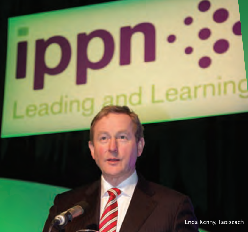
Enda Kenny, Taoiseach