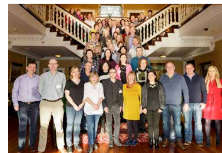
IPPN National Council 2016–2017