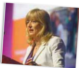
Emily O'Reilly, Ombudsman