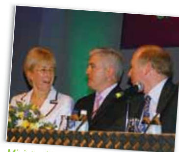
Minister Hanafin with Seán & Tomás