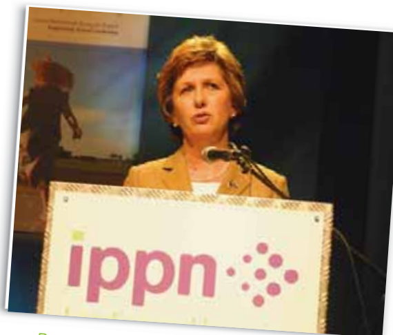
President McAleese addresses IPPN Conference