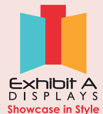
Exhibit A Displays