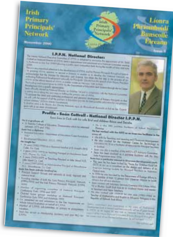
IPPN Newsletter - Issue 3

The President stressed that the role of the Principal needed to be defined, options for Principals 'stepping down' needed to be discussed and Deputy Principals