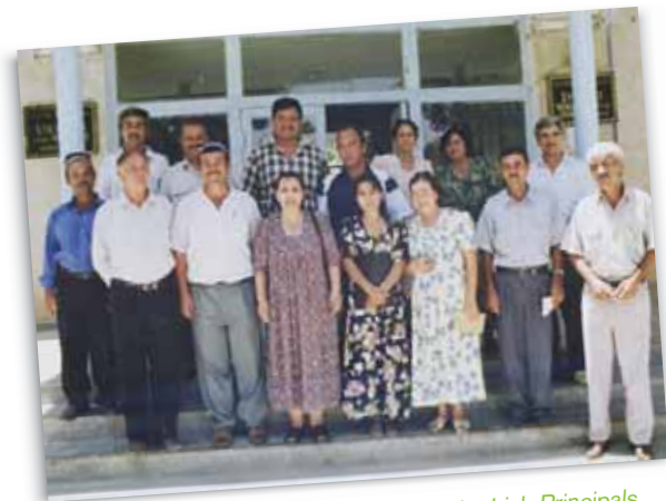
Tajik Principals attending workshops run by Irish Principals