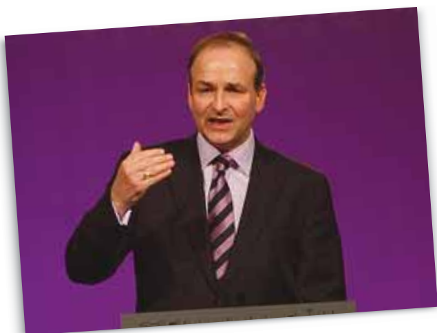
Micheál Martin TD

DES /Ministerial letter dated 18th January signed by the Minister for Education & Science, Micheál Martin TD stating that the Department "recognises the pivotal role of the Principal in the school community and is positively disposed towards providing support towards the establishment on a nation-wide basis of this new organisation". The officers were also informed that the Department would provide for "the secondment of a Principal Teacher for one year to act as a Director to the Network ....."