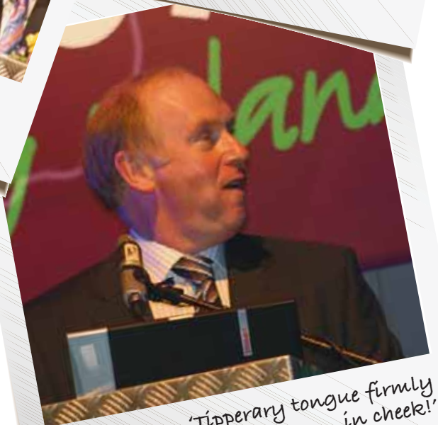
'Tipperary tongue firmly in cheek!'